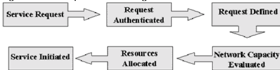
Figure 3. On-Request PVC Configuration